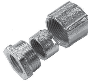
TPC - 50