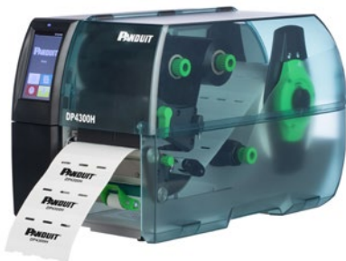
DP4300H/DP4600H High Volume Printers