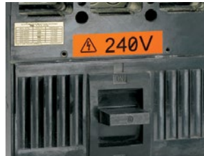
Electrical Hazard Labels