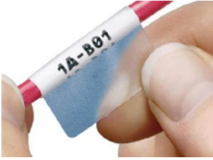
Wire and Cable Marking