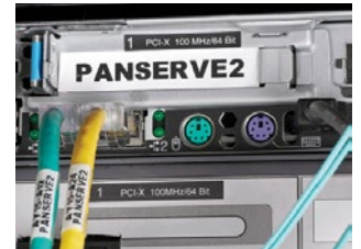
Network Infrastructure Labeling