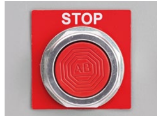
Raised Panel Labels