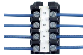
Terminal Block Labeling