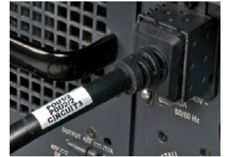
Electrical Infrastructure Labeling