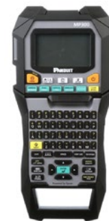
PXE™ Mobile Printers