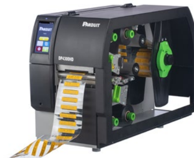
DP4300HD Two-Sided Printer