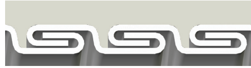
Interlocked Design 1-1/2" through 4" with no bonding wire