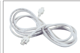
HU1011 18" Daisy Chain Connector