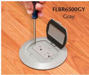
4 Fasten cover on box using the two #6-32 x 1" screws provided.