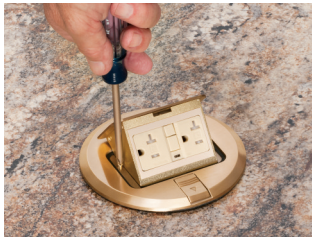
4 Install trapdoor coverplate to box using the two #6-32 screws provided. Round cover hides miscut openings