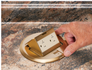
6 Rotate box/cover assembly into position, lining it up parallel with backsplash, if installing in a countertop.