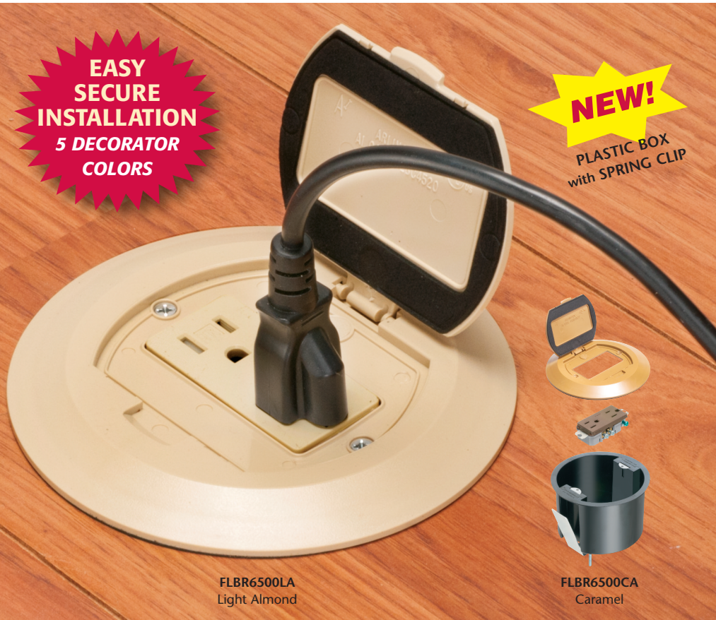
FLBR6500LA Light Almond