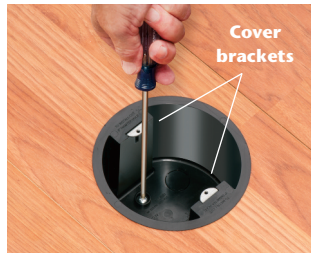
3 Rotate box to desired orientation. Tighten #10-32 screws to pull box securely against the underside of subfloor.