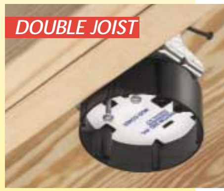
... for a UL/CSA Listed Installation of Fans/Fixtures up to 70 lbs!

Check out our complete line of fan/fixture boxes. We have a product that fits most applications or jobsite conditions!