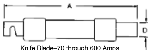
Knife Blade—70 through 600 Amps