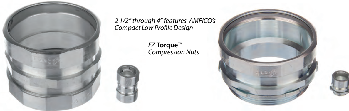
2 1/2" through 4" features AMFICO's Compact Low Profile Design

Available: Solid Alloy Steel Construction, Precision Machined EC Series: Compression Feature: AMFICO EZTorque Compression Nut Zinc Plated, Chromate Finish - Colors available Insulated Throat Bushing Option Available on Connectors*