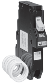
Type CH Single-Pole AFCl Circuit Breaker