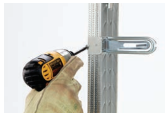
Support stays mounted to stud while securely attached with one screw