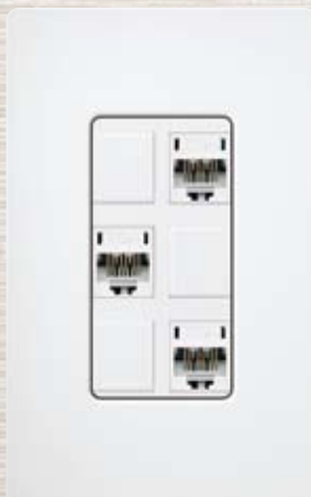
Customizable 6-port frame