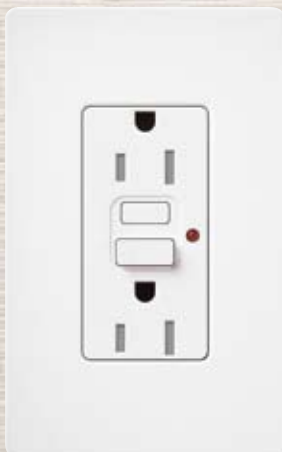
Tamper resistant GFCI receptacle