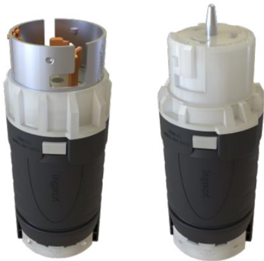
CS6365C Plug & CS6364C Connector