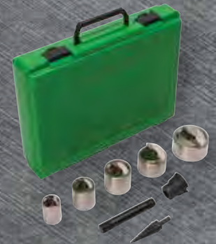
SPEED PUNCH™ KIT (without driver)*

Look for SPEED PUNCH™ products and "Try Me" display at supporting Greenlee distributors.