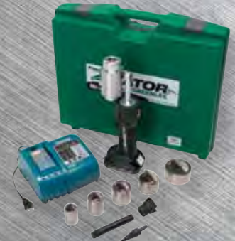
SPEED PUNCH™ KIT (w/LS50 Driver)

* Case accommodates Quick Draw or Quick Draw 90 Drivers - sold separately.