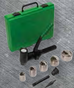
SPEED PUNCH™ KIT (w/Quick Draw 90 Driver)