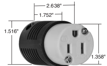
Dimensions for 15 & 20 Amp Connector