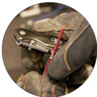
Features stripping notches