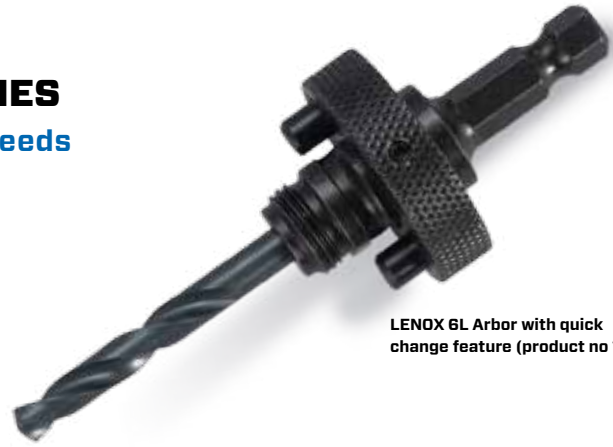
LENOX 6L Arbor with quick change feature (product no 1779805)

Split point pilot drill for faster penetration and less walking