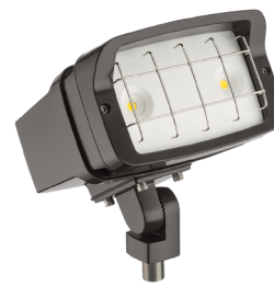
Wire Guard OFL1WG