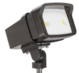
Vandal Guard (Polycarbonate lens) OFL1VG