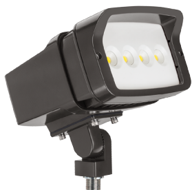
THK- Knuckle with 1/2" NPS threaded pipe