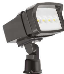
Slipfitter attachment DSXF1/2 TS